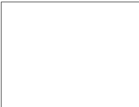
Figure 2. Relative event rates for 15 GeV solar \chi particle annihilation neutrinos (solid line) and atmospheric cosmic-ray produced neutrinos (dashed line). The \chi neutrino spectrum was computed using the Lund Monte Carlo program as in [14,19].

ter neutrinos. However, the small neutrino cross section, and the resulting transparency of matter to neutrinos, can also work in favor of dark matter neutrino detection. The Sun can attract and gravitationally focus galactic \chi particles, where they can be scattered by solar protons and captured. They then lose energy by further collisions, eventually finding themselves concentrated in the Sun's core where their annihilation rate is enhanced [30]. The \chi density in the solar core builds up to the point where the \chi\chi annihilation rate reaches equilibrium with the solar \chi capture rate [31]. Whereas the other \chi annihilation products will not escape from the Sun's core, the neutrinos will, providing a potentially detectable point-source signal with a characteristic spectrum e.g. [32]. The neutrinos from \chi\chi annihilations will have typical energies of at least several GeV, perhaps tens of GeV. They are thus easily distinguishable from other solar neutrinos and in the energy range for neutrino telescopes presently planned or under construction.